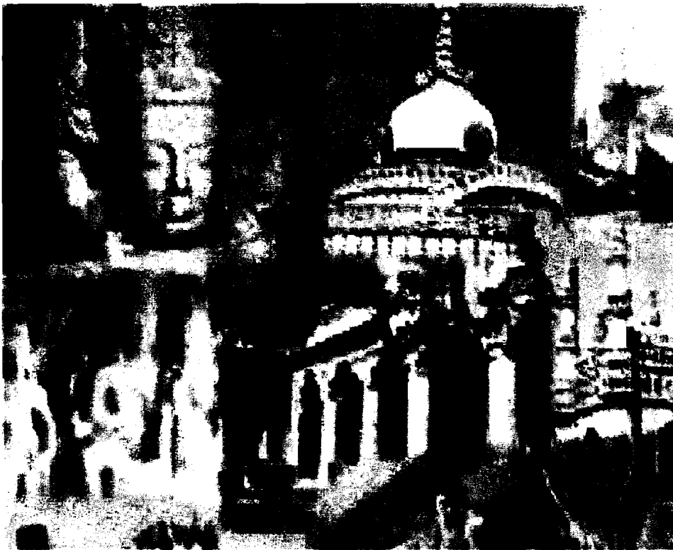
Religions, art, drama, and architecture influence society deeply world-wide.

During the first phase of the development of sociology of religion, the interest was focused mainly to tracing the origin and evolution of religion. Explanations of two