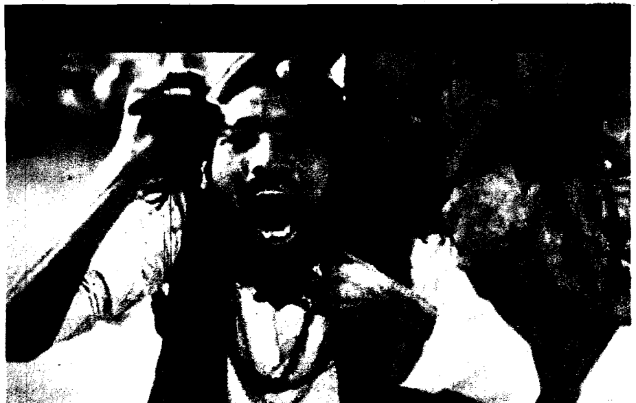
Magic attempts to direct the supernatural power to achieve specific ends

Religion refers to ultimate problems and meaning of human existence (e.g. death, failures etc.), whereas magic is concerned more with immediate problem like control of weather, drought, victory in battle, prevention of disease. Within religion, one prays to gods and pleads with them, whereas in magic, the magical manipulates the supernatural power. Religion makes a person believe in the power of the supernatural. On the contrary, in magical practices, the adherent believe in the own power to manipulate the power of the supernatural. It needs to be pointed out that religion and magic are not completely distinct.