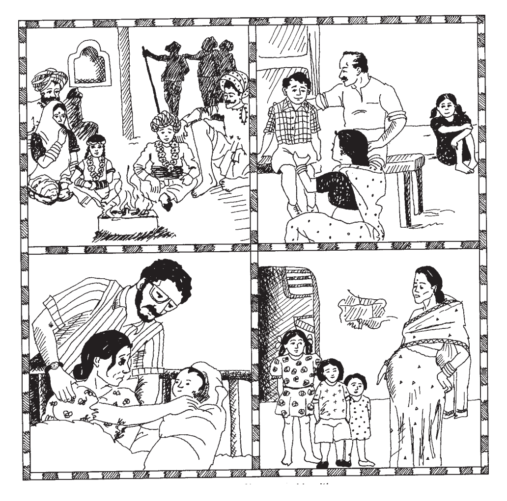
Figure 33.1 Women and health